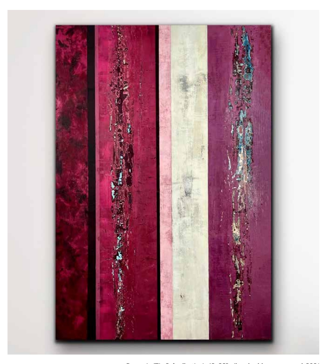
Roseraie (Ein Sof collection), 48x36", oil and cold wax on panel, 2021