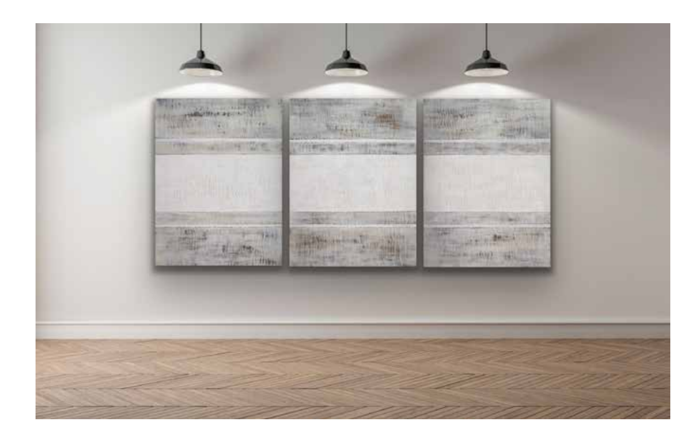
Soham I - III (I AM), Triptych, 45x45, encaustic on panel, 2022