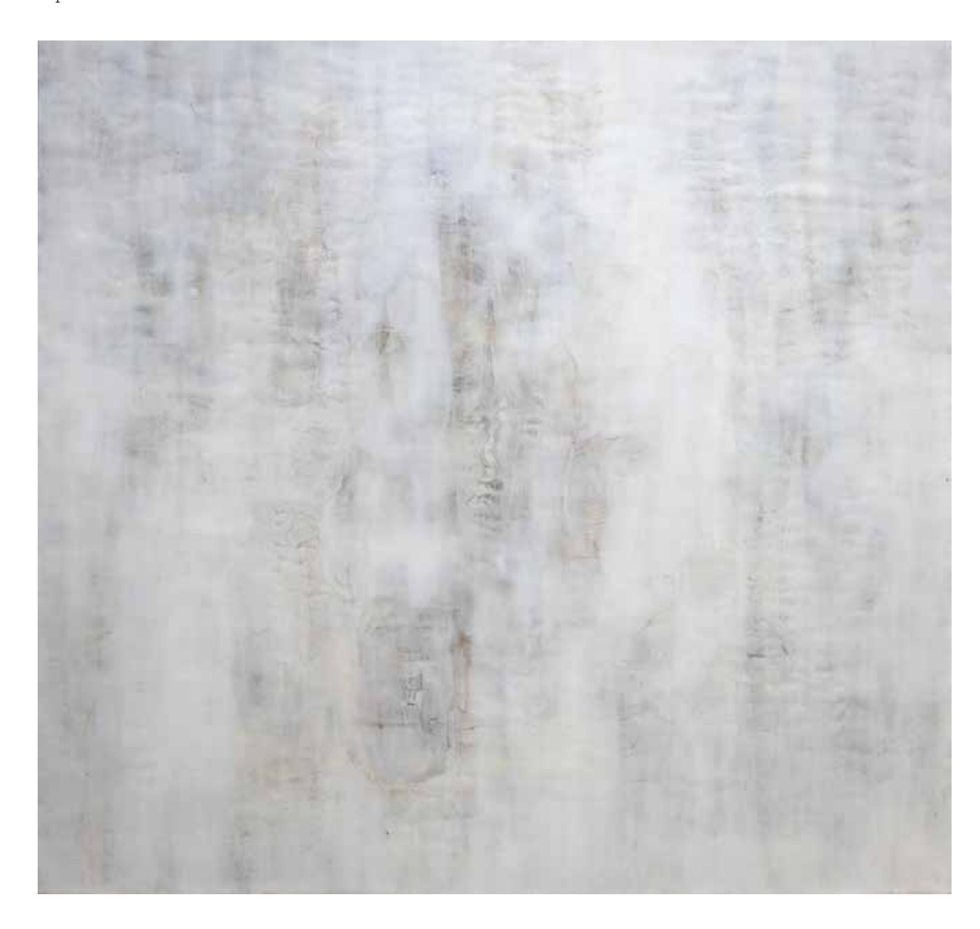
Joti II (Divine Light), 45x45, encaustic on panel, 2022

Awakened from shadow to light. I AM. For the shadow to be revealed, light must be. For my eyes to see, light must be. Nature and Art are pure forms of divine expression that connect us all and enable us to transcend life's impermanence. We gravitate towards it when it shows us a piece of ourselves, we recognize. Suddenly, separation becomes a mere illusion.