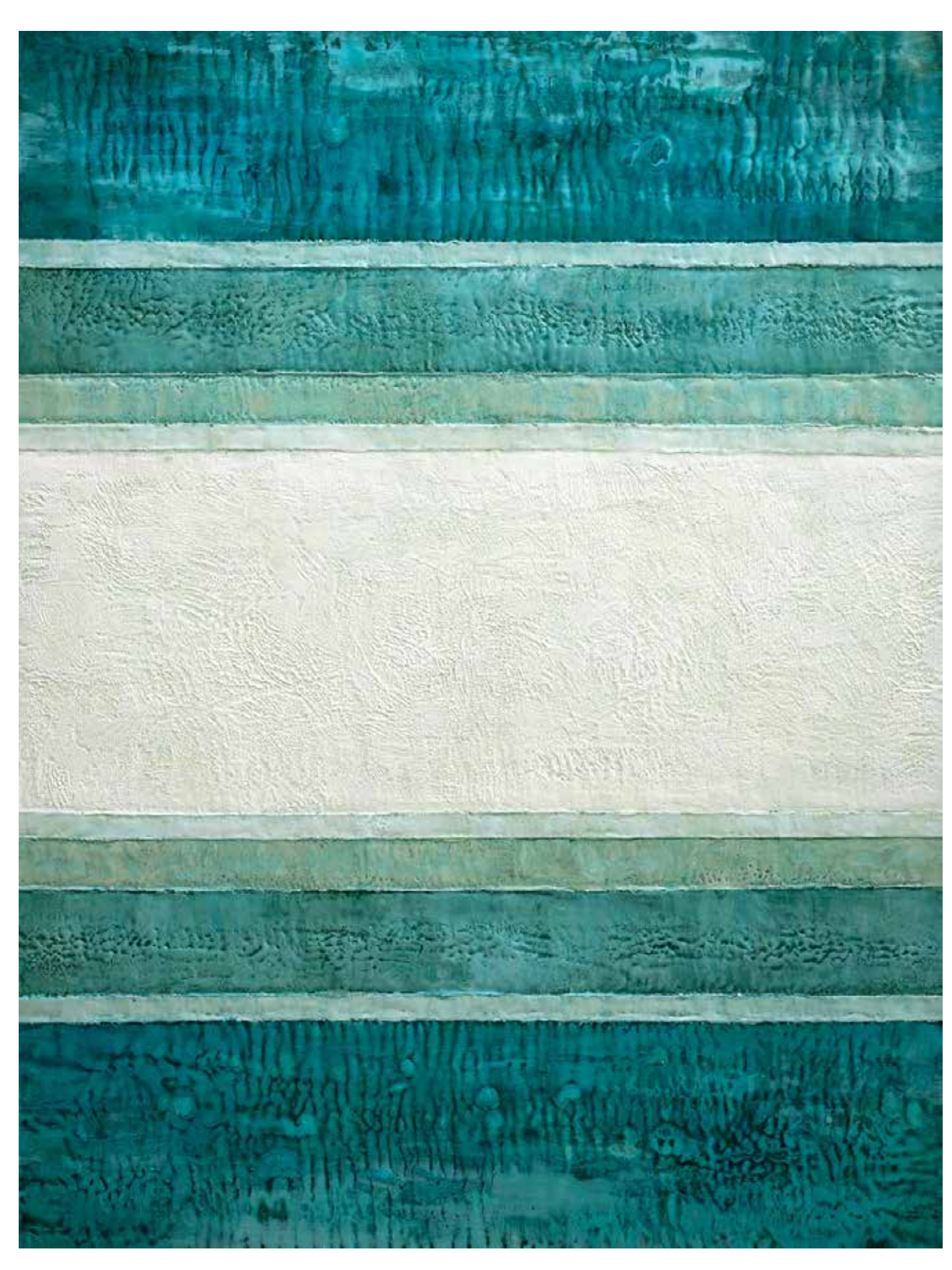
soham (Ein Sof collection), 48x36", encaustic on panel, 2022