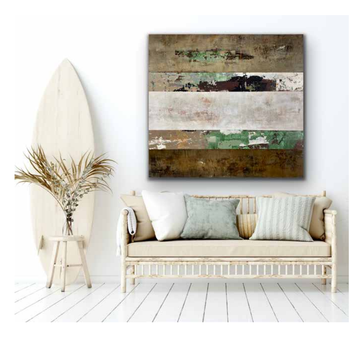
Cubana (Ein Sof collection), 30x30", oil and cold wax on panel, 2021