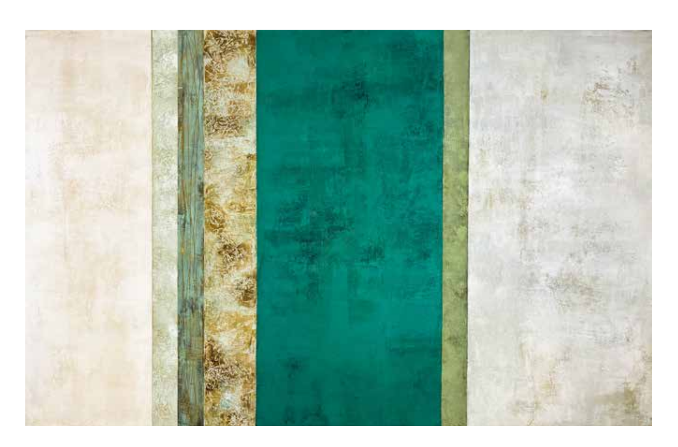
Rosas (Ein Sof collection) 36x48", oil and cold wax on panel, 2021

Balbinot writes: This collection of paintings showcases the evolution of my work and are the embodiment and mother of all inspirations, distilling all that I hold dear. As part of my process, I deliberetaly place myself in a state of heart/brain coherence using special brain wave frequencies. These unable me to achieve a meditative state. Going deep into the concept of coherence and tapping into the vast pool of the subconscient allows me to get out of my own way and open up the creative channels.