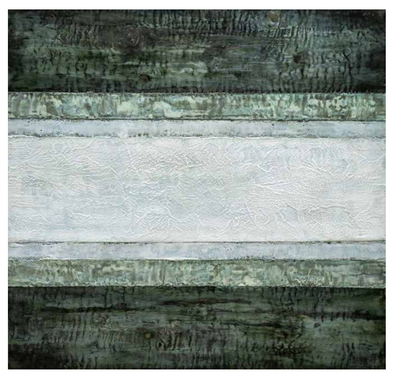
Mokuzai (Ein Sof Collection), 30x30 encaustic on panel, 2021 (sold)