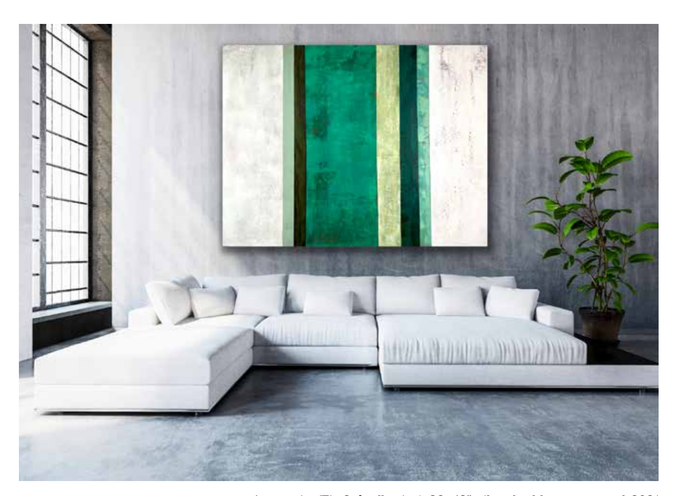
Amazonite (Ein Sof collection), 36x48", oil and cold wax on panel, 2021