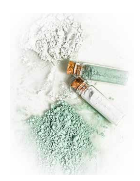
If I knew what the picture was going to be like, I wouldn't make it." - Cindy Sherman