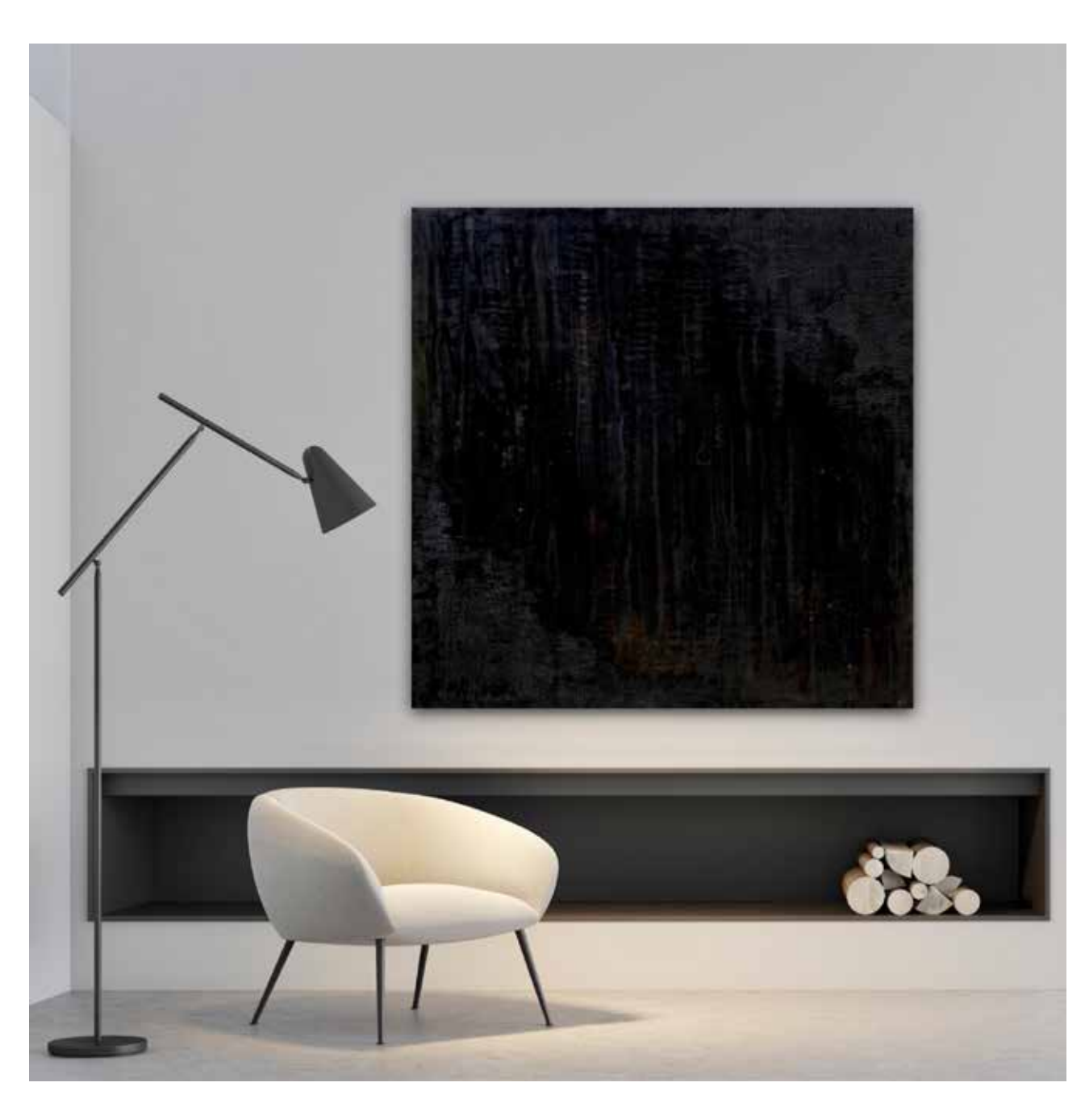
Tamas (Darkness) In Situ - 2022