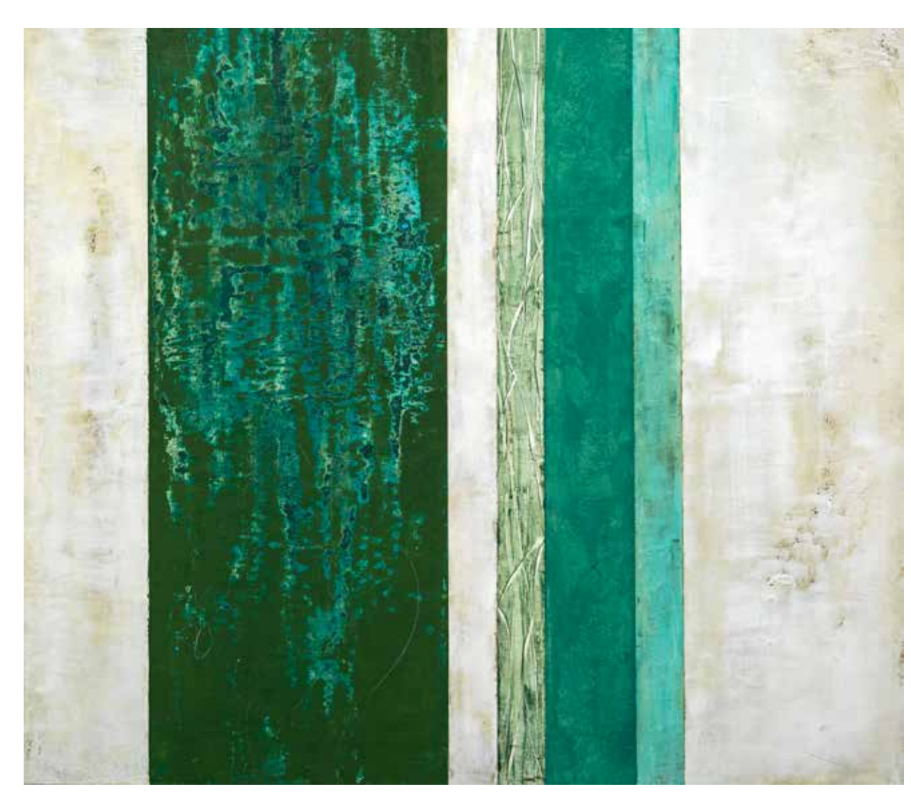
Ki Wintergreen (Ein Sof collection), 36x36, oil and cold wax on panel, 2021