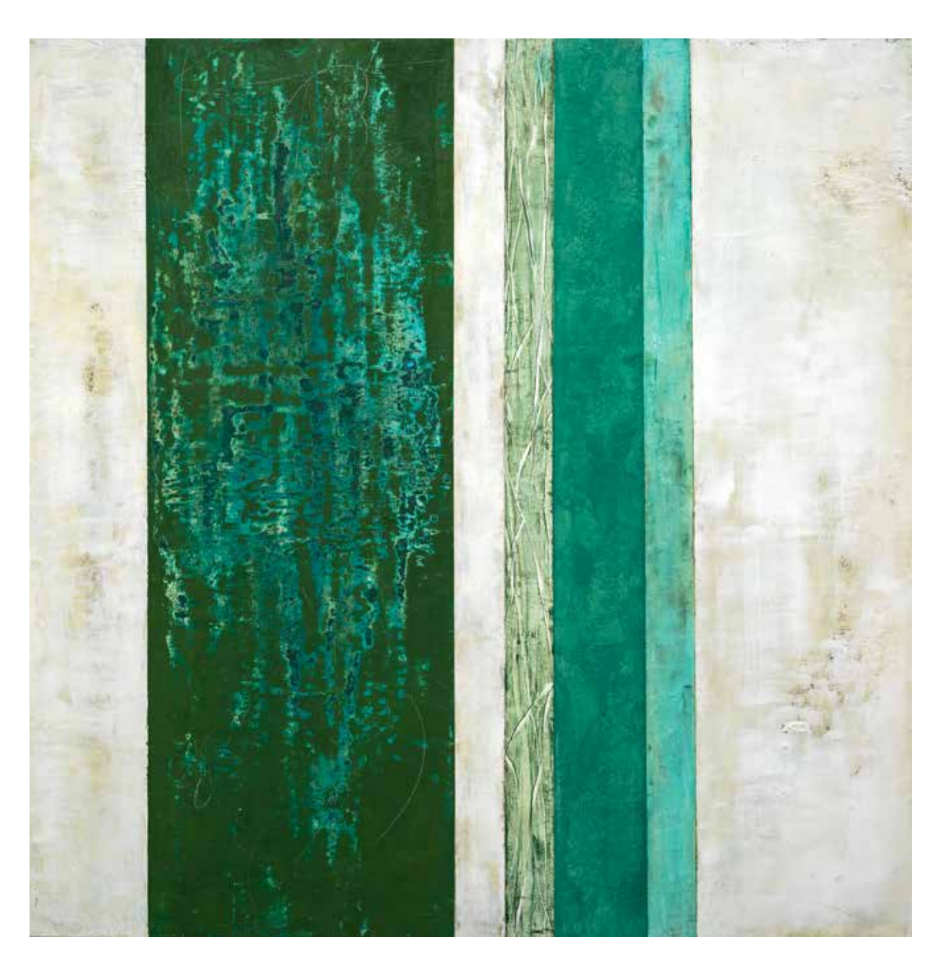
Ki Wintergreen (Ein Sof collection), 36x36, oil and cold wax on panel, 2021