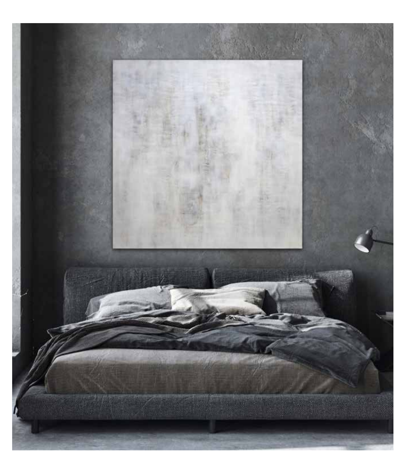
Joti II (Divine Light) In Situ - 2022