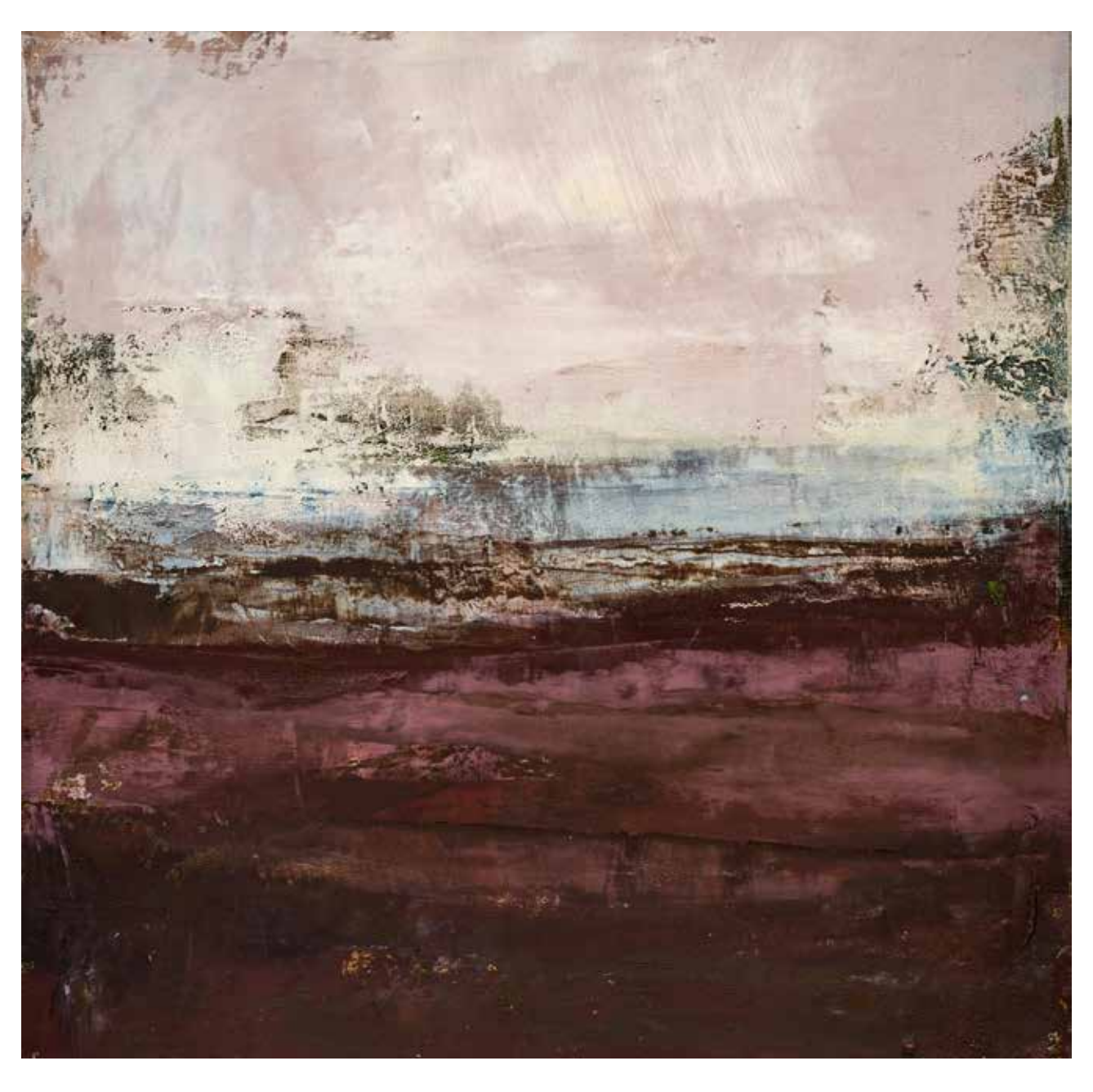
Landscape study V, 12x12", oil on board, 2021 (sold)