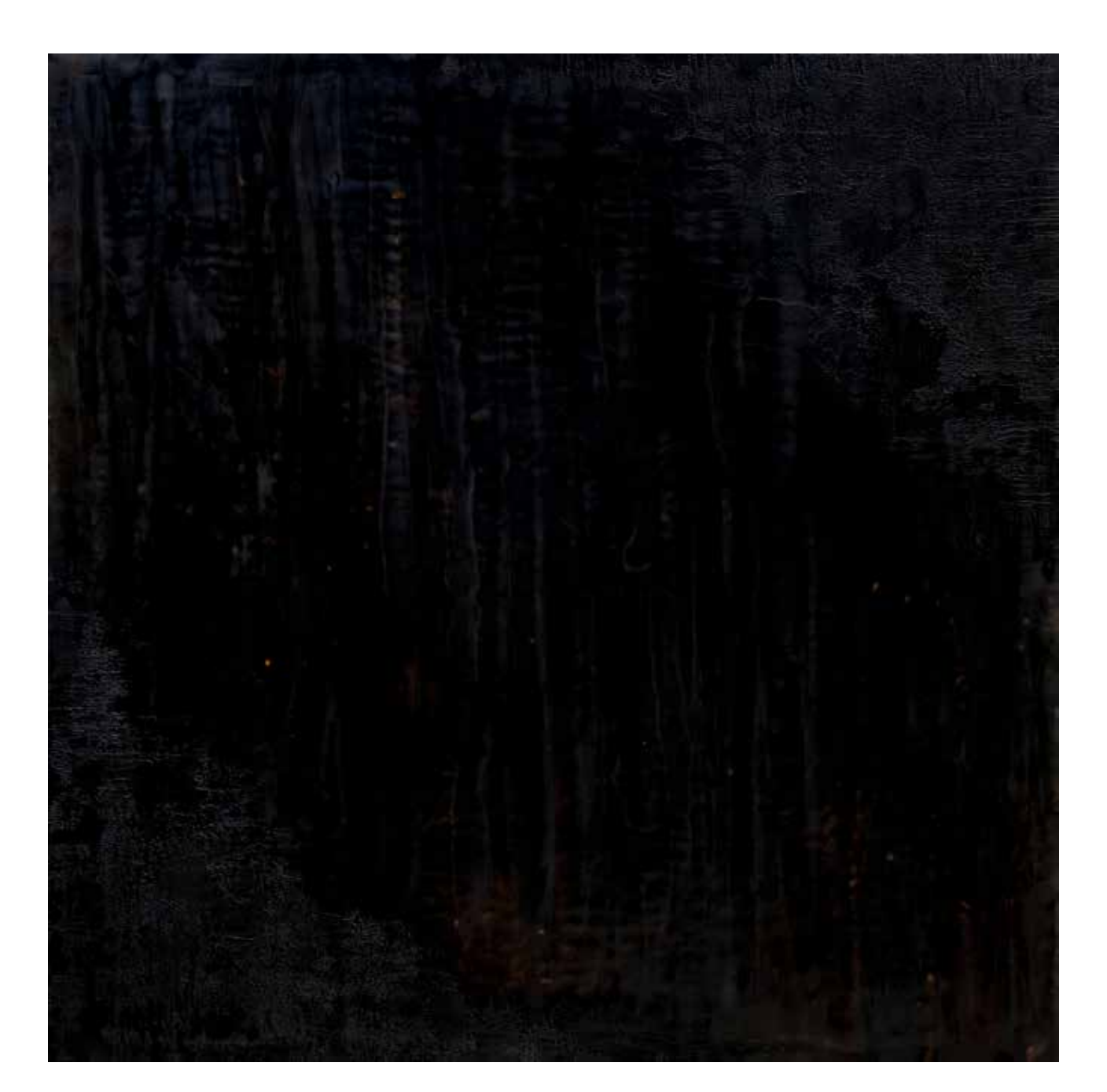
Tamas (Darkness), 45x45, encaustic on panel, 2022