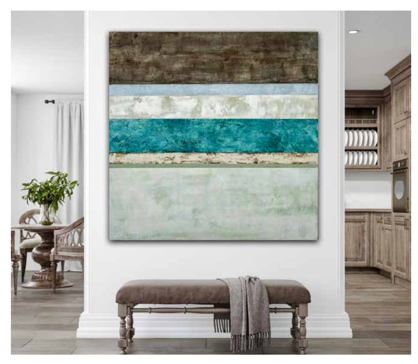
Dune, 36x36", oil and cold wax on panel, 2021